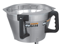
FUNNEL ASSY W/ BASKET, TITAN