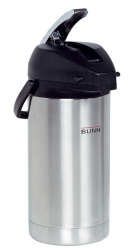
AIRPOT, 3.8L SST LA SINGLE PK