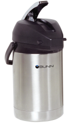
AIRPOT, 2.5L SST LA SINGLE PK